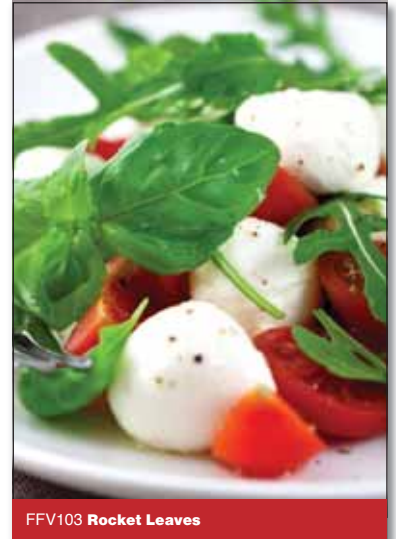
FFV103 Rocket Leaves