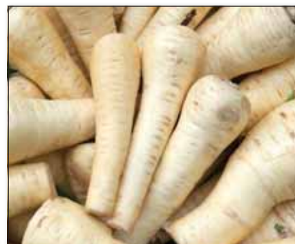
FFP026 Parsnip Whole

All prepared products are sealed for freshness in vac pack packaging.