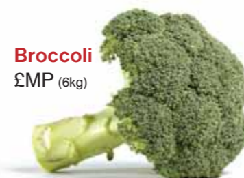
Broccoli £MP (6kg)