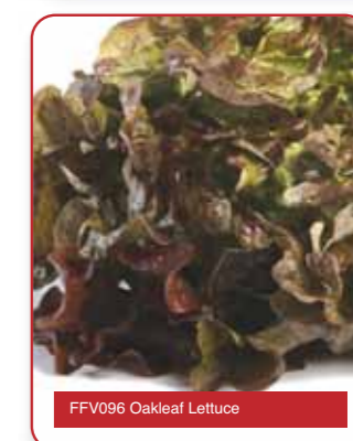
FFV096 Oakleaf Lettuce